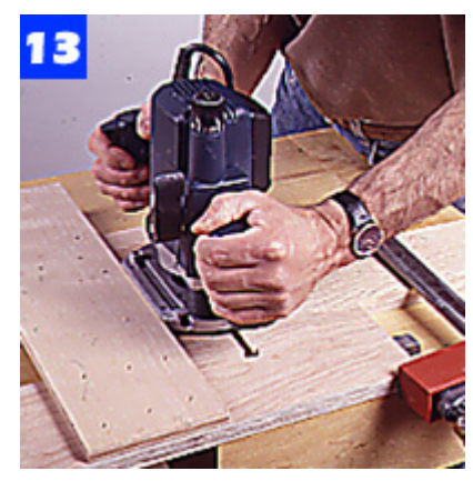
Rout slots in the drawer face for the drawer sides with a dovetail bit. Use a square U-shaped jig to guide the router.