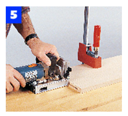
Clamp the bottom shelf securely to a workbench. Then use a plate joiner to cut joining slots in both ends of the shelf.

drill press to remove most of the waste and a sharp chisel to finish the cuts.