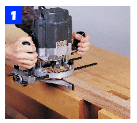
Use a router with an up-cut spiral bit and an edge guide to cut the rail mortises in the table legs. Make several passes.

Mark the locations of the slat mortises in the side rails. Clamp a tall fence to the drill-press table to help locate the rails, then bore overlapping 3/8in.-dia. holes to remove most of the waste (Photo 4). Complete the mortises by smoothing the walls and squaring the ends with a sharp chisel.