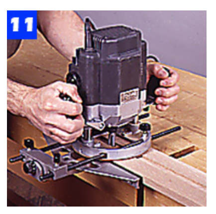
Clamp each drawer guide between bench dogs. Then rout a 1/4-in.-deep x 3/4-in.-wide dado in the center of each.

Clamp the side assemblies to the back rail and shelf and check the parts for square. Readjust the clamps if necessary.