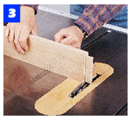
Use a dado blade in a table saw to cut the rail tenons. First cut the cheeks, then readjust the saw to cut the shoulders.