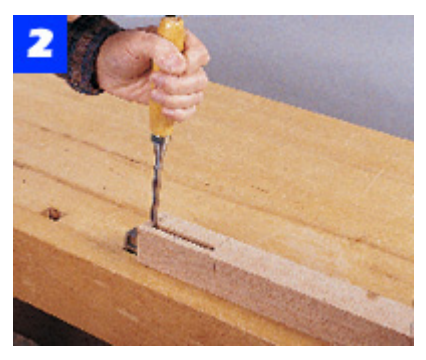
When the routing is done, carefully square the ends and flatten the sides of each mortise with a sharp chisel.