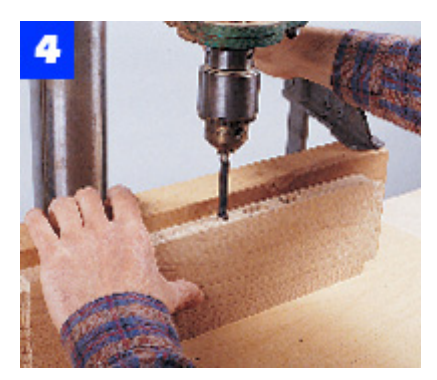
Cut the slat mortises in the rails using a