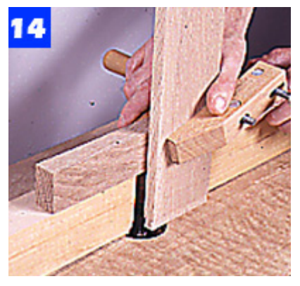
Use the same dovetail bit in a router table to cut both sides of the dovetails on the ends of each drawer side.

Set the dovetail bit--we used a Bosch No. 85240-to cut 7/16 in. deep, then make an indexing cut into the fence of your jig to make locating your cut easy. Mark the position of the two slots--along with an end mark for each slot--on the inside surface of the drawer face, centered on the length of the face blank. Clamp the face to the routing jig with the indexing cut centered on one mark. Slide the router bit into the slot, turn on the motor and guide the tool along the jig to the end mark of the slot (Photo 13). Turn off the router and slide the bit back to the indexing cut to remove it. Repeat for the other slot. Cut the face to finished length.