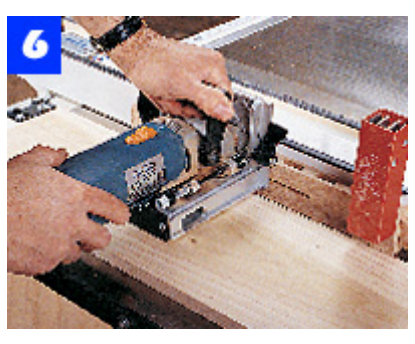
Clamp the bottom rails to your table saw fence. Then use a plate joiner to cut joining slots in one side of both rails.