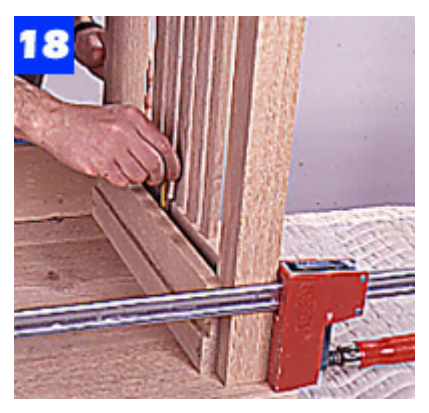
Center the base over the top and mark the fastener holes. Then bore pilot holes in the top and attach the base.