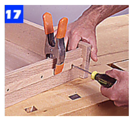
Slide the drawer bottom in place and attach it to the back with screws. Also, screw the guide strips to the sides.

Apply glue to all the drawer joints, then clamp the box together. Reinforce the side-to-back joints with brads.