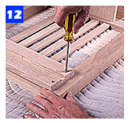
Bore and countersink pilot holes in the drawer guide strips. Then attach them to the legs with 1-1/4-in. No. 8 fh screws.